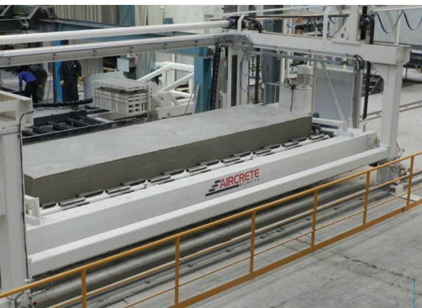
The new cutting line was successfully integrated with the plant's existing infrastructure