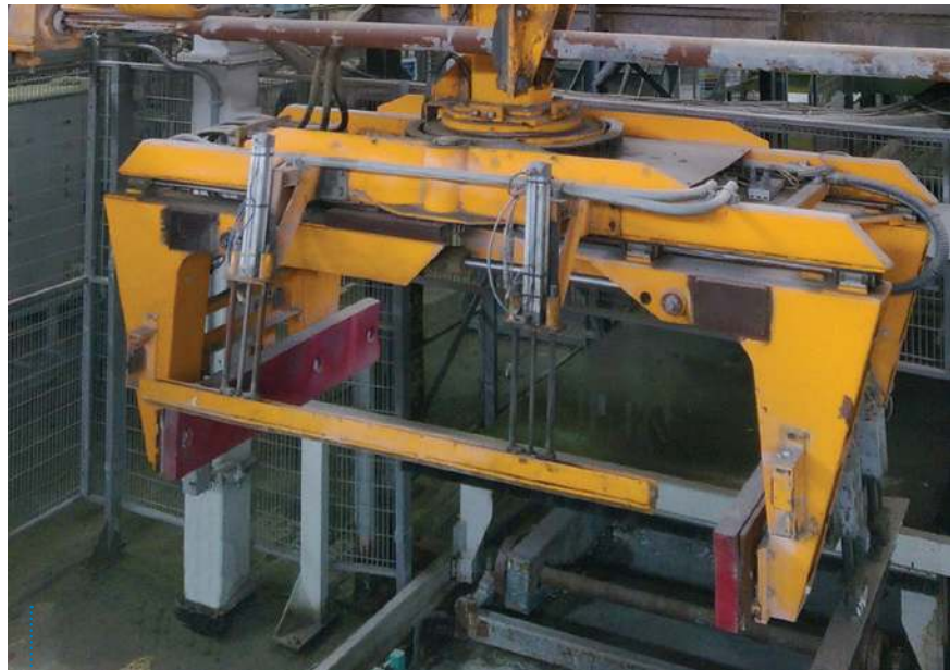
The old gripper on the unloading line was not able to hold new products

The customer received a detailed engineering re-work plan with indicative budgets so that they can choose among options from different solution providers. In the end, the project was outsourced to Aircrete Europe and was delivered in a couple of weeks.