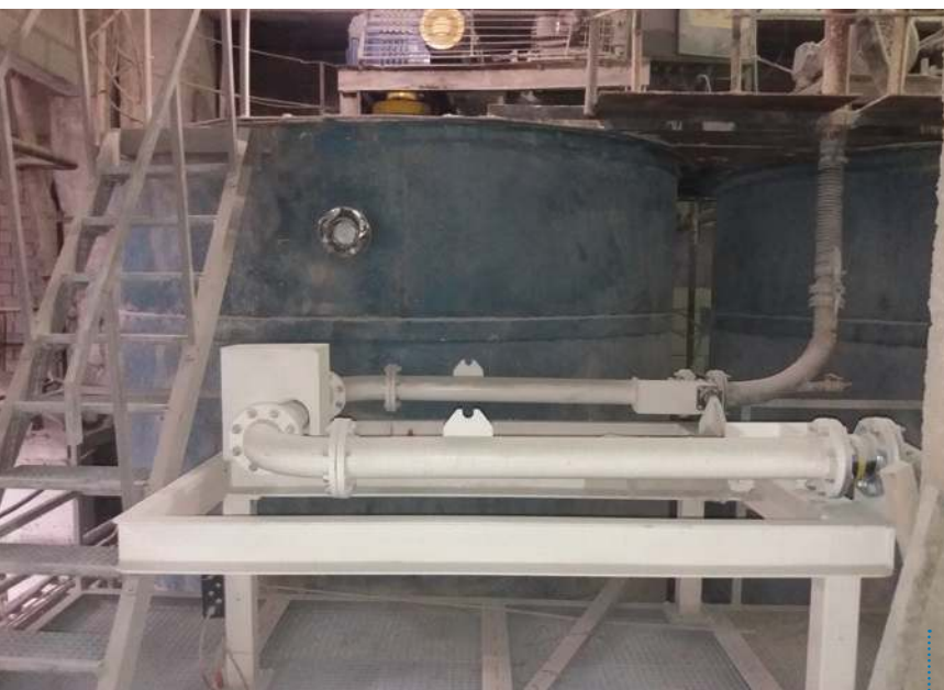
The u-pipes installed after plant scan are integrated with the mixer control system