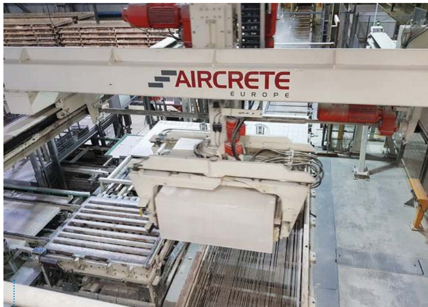
Replacement of the gripper after plant scan enabled heavier products to fit on the pallets