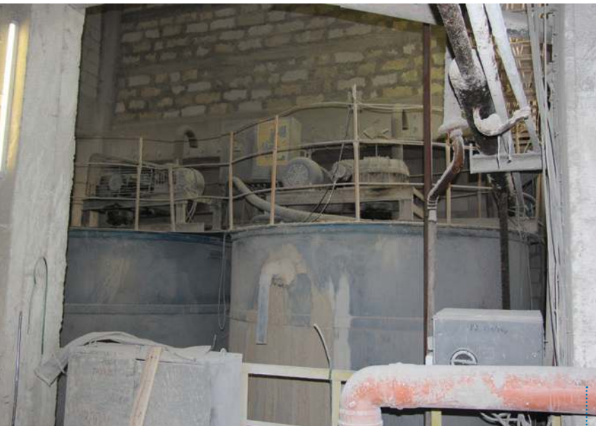
It was hard to keep the slurry density under control through manual measurements