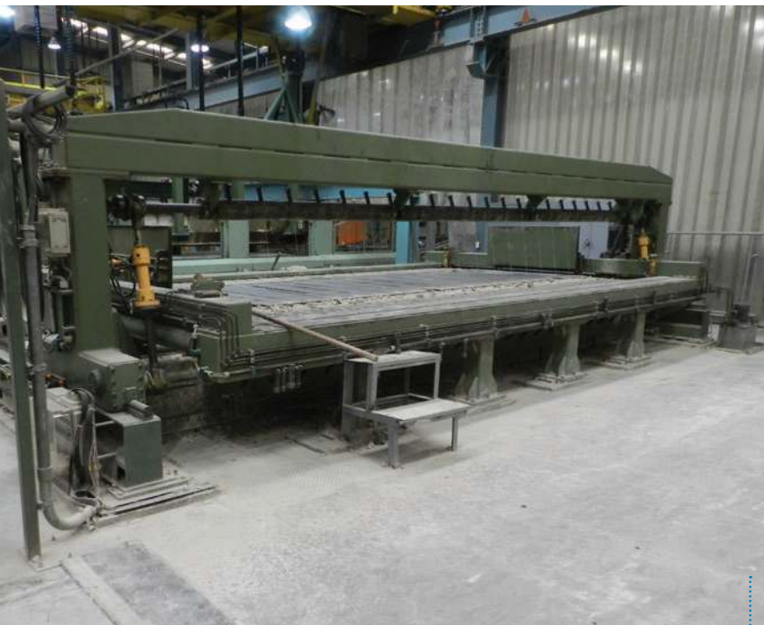
The cutting line was not suitable for products with 5 mm incremental thicknesses and super smooth surfaces