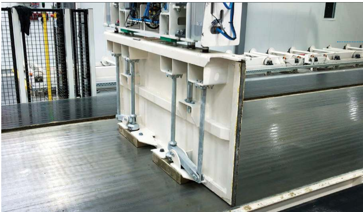
Fig. 9: The movable door is picked up by the door manipulator and placed on the desired position as per the configuration on the plant automation system.

these advantages and facilitate an AAC plant to become a market pioneer, growing continuously with the market demand changes. ●