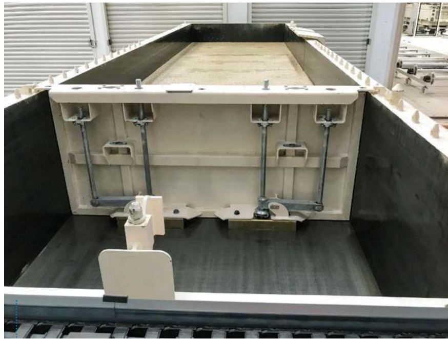
Fig. 8: With the Aircrete Movable Mould Door, the size of the mould is configured just before casting through the integrated plant control system.

Plants using moulds with hinged doors can - in most cases - be modified to implement this innovative solution. This will allow them to benefit from all