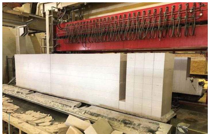
Fig. 3: The waste layer between the panels and blocks creates additional white waste that needs to be dealt with.

In other plants utilizing Hebel technology with mov-