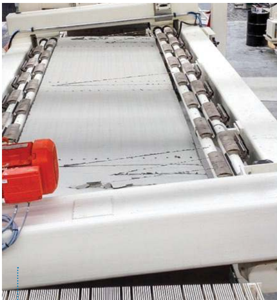
Fig. 4: Cutting panels with rest blocks leads to the most common problem of dealing with by-product blocks that does not fit market dimensions and densities.