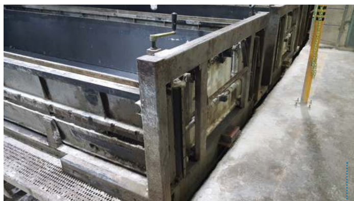
Fig. 7: Adjustment of the movable back doors are executed manually by releasing the outer frame on the movable back door and fixing it again at the desired length with clamping levers.