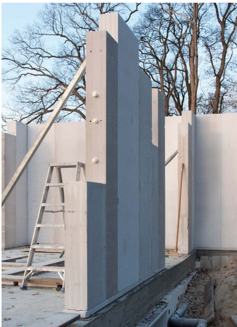
Fig. 1: The diverse prefab AAC elements of the Aircrete Building System incorporate usage of different sized panels, in line with the building drawings and plans.

The global construction industry is under continuous obligation to innovate and transform. Although social and environmental drivers are important in this transformation, the main motivation for developers and builders today still comes down to reducing cost, complexity and time of construction projects. Every market has its own dynamics, culture and drivers but, skilled labour shortage and rising labour cost inevitably come into play at some stage. Consequently global construction trends show a move to larger, prefab elements, resulting in a shift of construction from the building site to the factory.