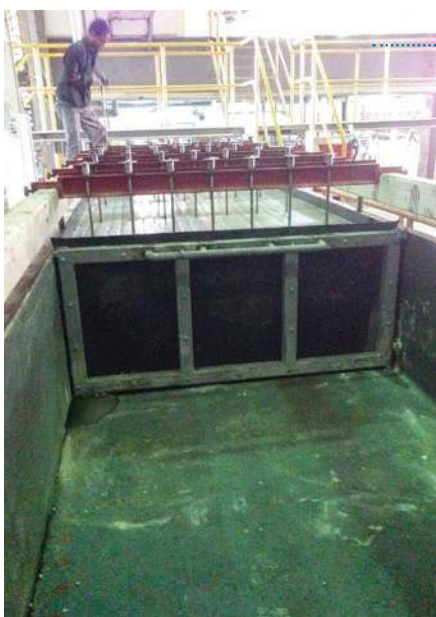
Fig. 6: Leakage of the mix is a commonly faced issue in moulds where all sides are fixed.

As a global leader in AAC panel technology, Aircrete Europe has been assisting AAC producers with improving the efficiency of the AAC panel production process for decades. One of the recent innovations from Aircrete Europe is the fully automatic adjust-