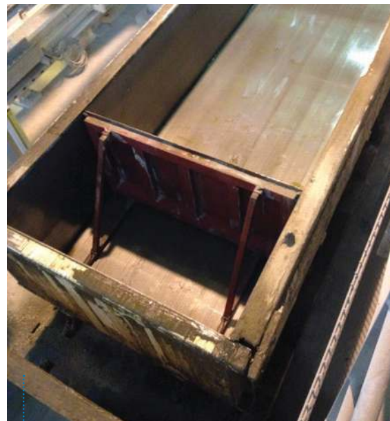
Fig. 5: Using damming walls inside the moulds for getting shorter cake lengths is one of the preferred options for plants with non-movable back doors.

able back doors, changing the current size setting of the mould is usually performed by human intervention. The outer frame of a typical movable back door is released from its originating position and pushed or pulled manually along the side wall of the mould until the desired mould length is reached.