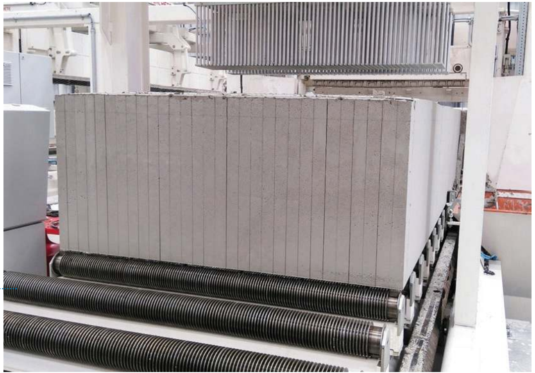
Fig. 4: Flat-cake cutting enables all the cuts on the cake remain open after cutting, ensuring no risks of sticking.

solutions. Panel reinforcement is fabricated from concrete reinforcing steel, which is usually supplied as coil. A fully automatic welding machine is an automated solution for welding steel on-site into cages or meshes. The automated reinforcement frame configuration reduces the need for additional operators or manual handling and therewith enables higher production efficiency and a greater variety of products. Besides, precise positioning of the reinforcement within the panel at this stage is crucial for the cutting phase, which all plants need to achieve for an efficient cladding panel production (Fig. 3).