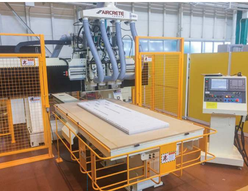
Fig. 8: Aircrete panel milling system.

The Aircrete panel milling system itself is a complete solution with a programmable CNC milling machine suited for AAC panels (Fig. 8). This solution includes the machinery, control system, first batch of milling tools as well as integration with the rest of the systems and the existing equipment. By choosing the right tools in combination with the embedded software, all type of patterns, even texts can be milled