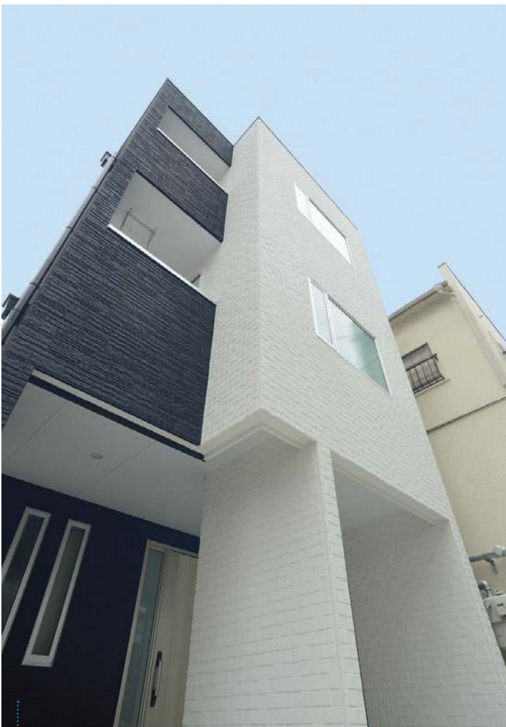
Fig. 1: The superior earthquake-resistance performance, insulation qualities as well as its ease of installation have made AAC cladding panels a first choice for many residential construction projects in Japan [2].

An increasing need for faster and more cost-effective construction drives a global trend for continuous innovation in new building materials and more efficient building applications. It is therefore not surprising to notice an acceleration in a global shift from AAC blocks to AAC panels. For AAC producers, it is however not simply a switch of the button to change from AAC block to AAC panel production overnight [1]. Besides additional equipment required for adding reinforcement to the production process for example, which is the easiest part to overcome, the main critical element lies right in the heart of the factory: the right cutting technology.