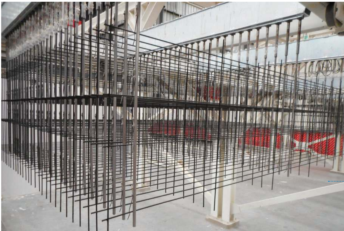
Fig. 3: A close-up view of the reinforcement assembly area prepared for thin panels.