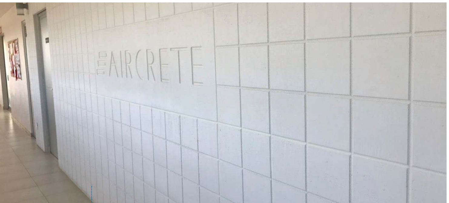
Fig. 9: Texts and even logos can be milled on AAC cladding panels with the Aircrete surface panel milling system.

Aircrete Europe Münsterstraat 10 7575 ED Oldenzaal, The Netherlands T +31 541 571020 info@aircrete.com www.aircrete.com