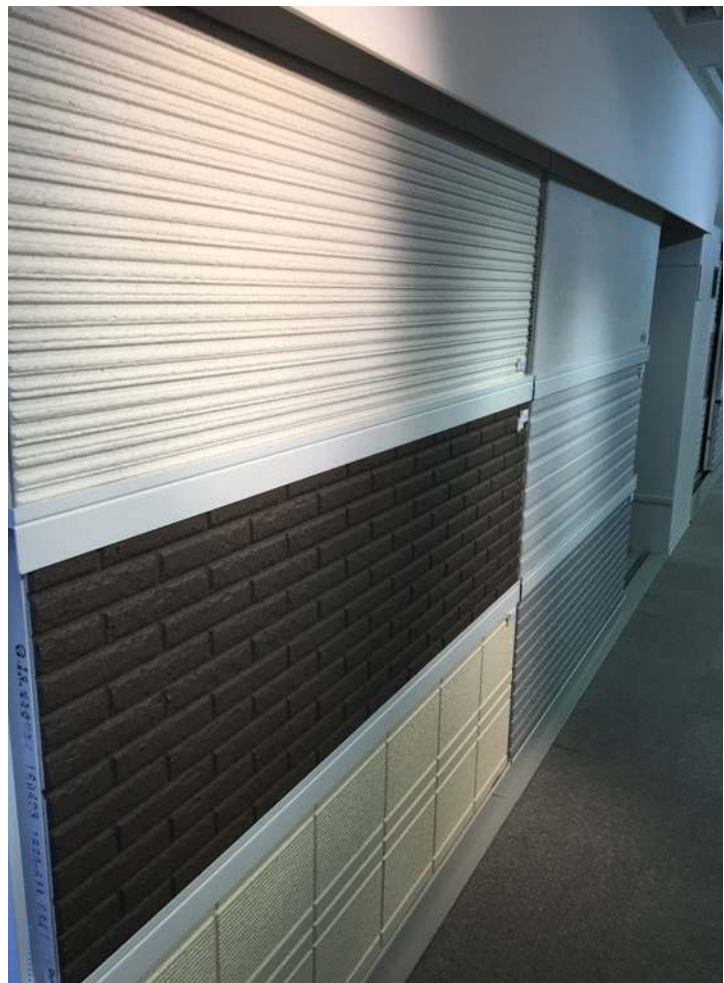
Fig. 7: Cladding panels can be milled, coated and painted to enhance performance and esthetical appearances [4].

The after-treatment line also plays a vital role in the production process, as it allows for possibilities to even further finalize the prefab element before it goes to site, supporting the trend of moving construction from the building site to the factory. In the after-treatment area, patterns can be milled on finished panels to provide them with esthetical appearances and the panels can even be coated and paint-